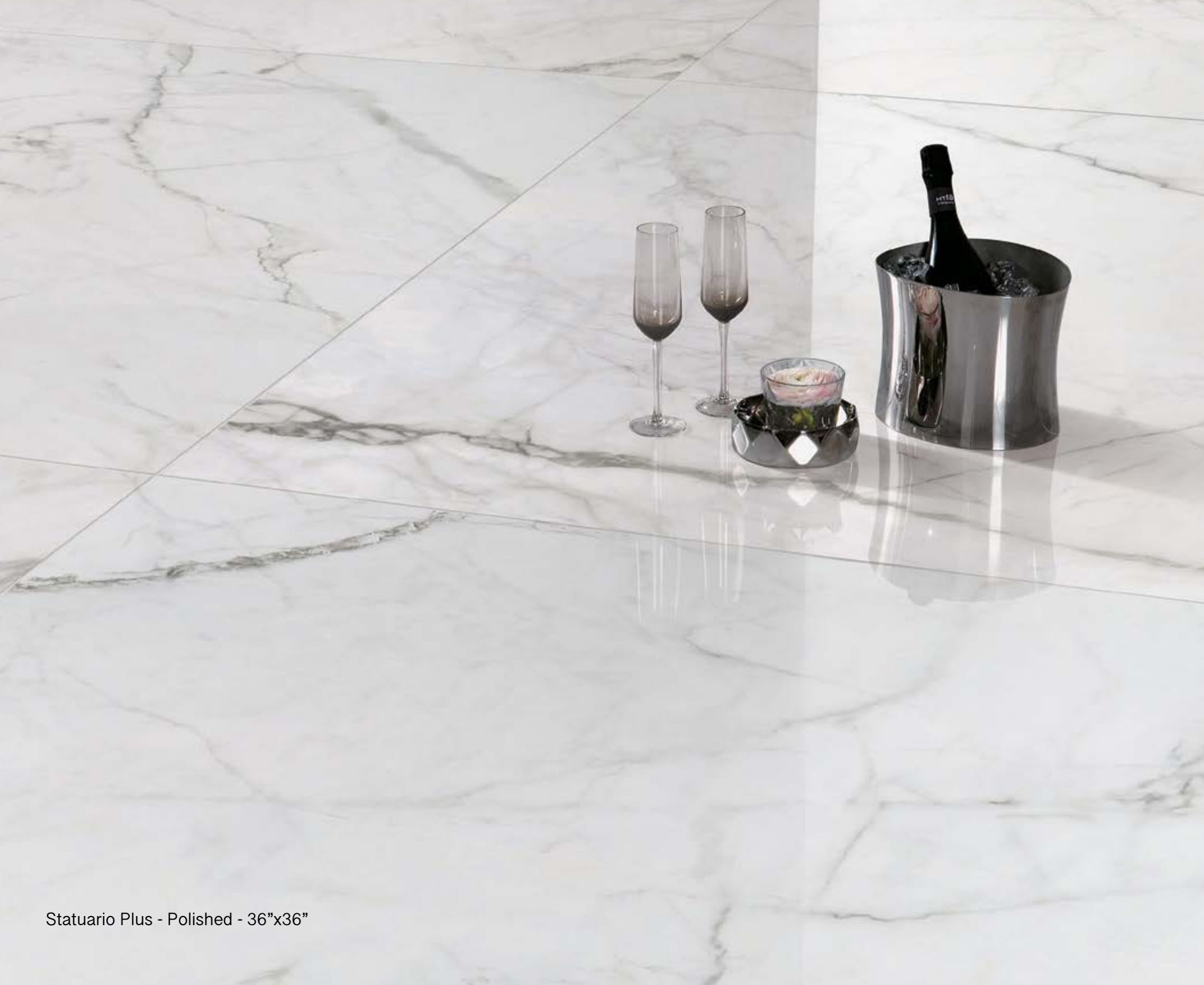
Statuario Plus - Polished - 36"x36"