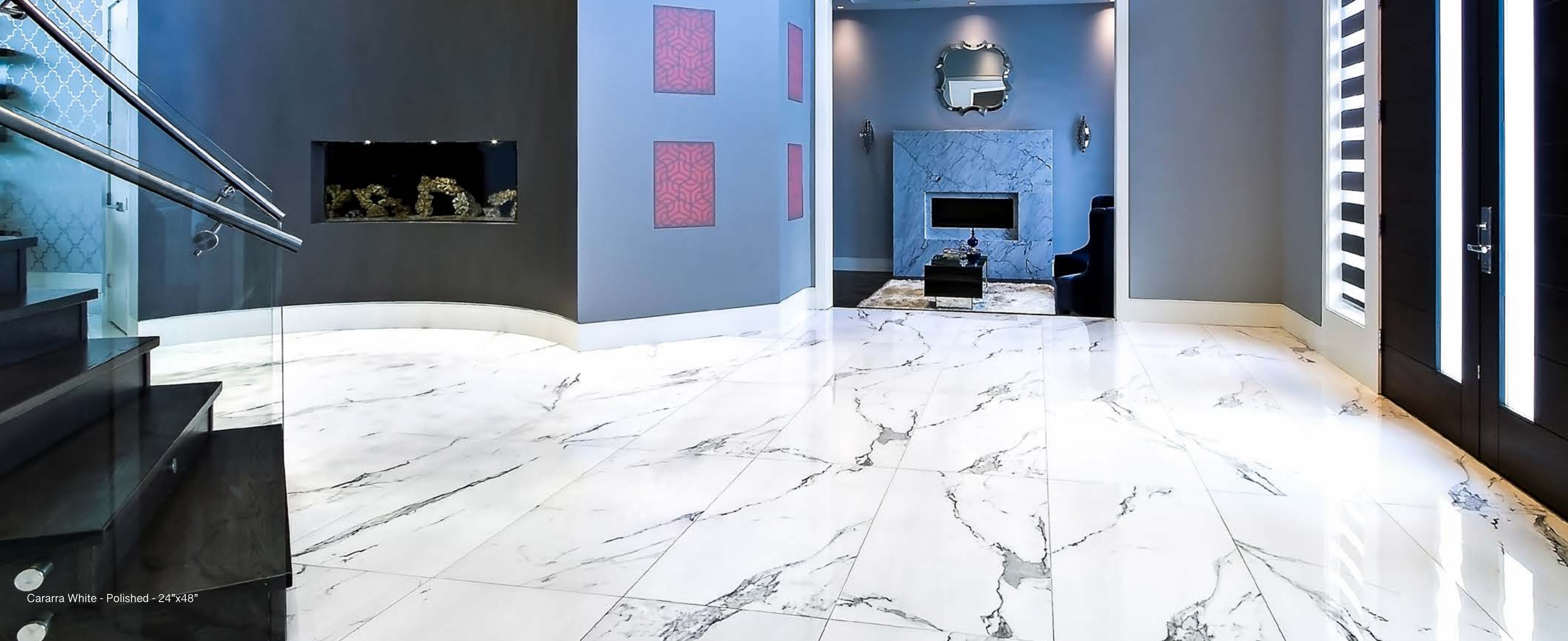
Cararra White - Polished - 24"x48"