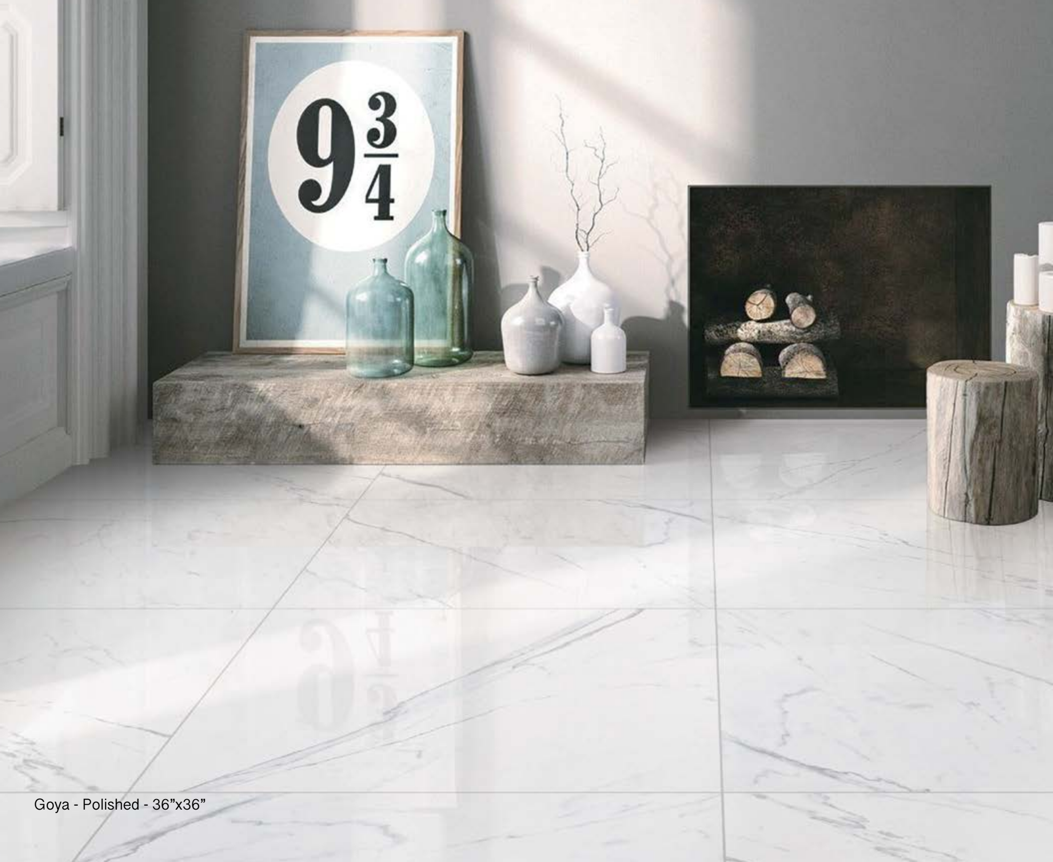
Goya - Polished - 36"x36"