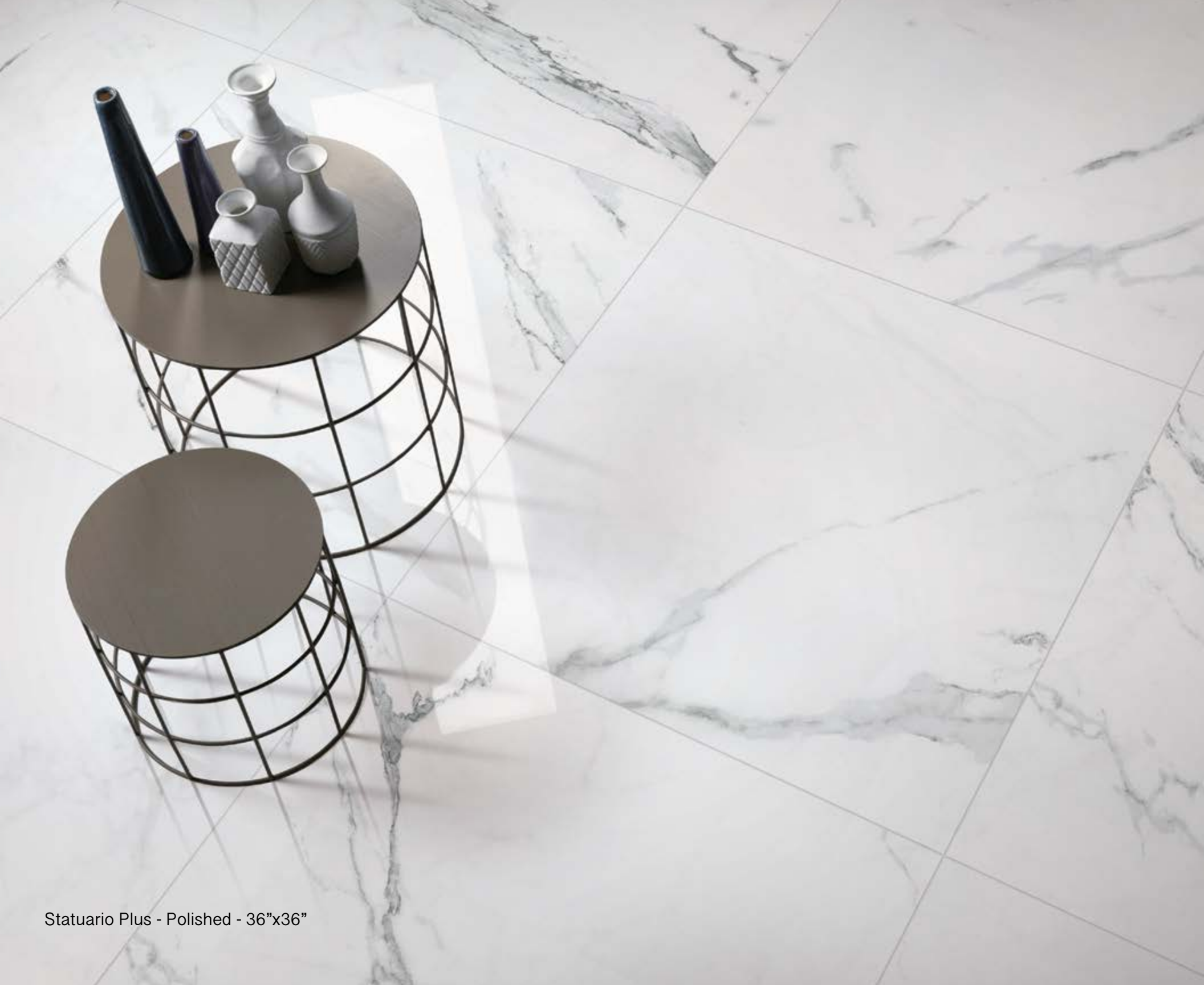
Statuario Plus - Polished - 36"x36"