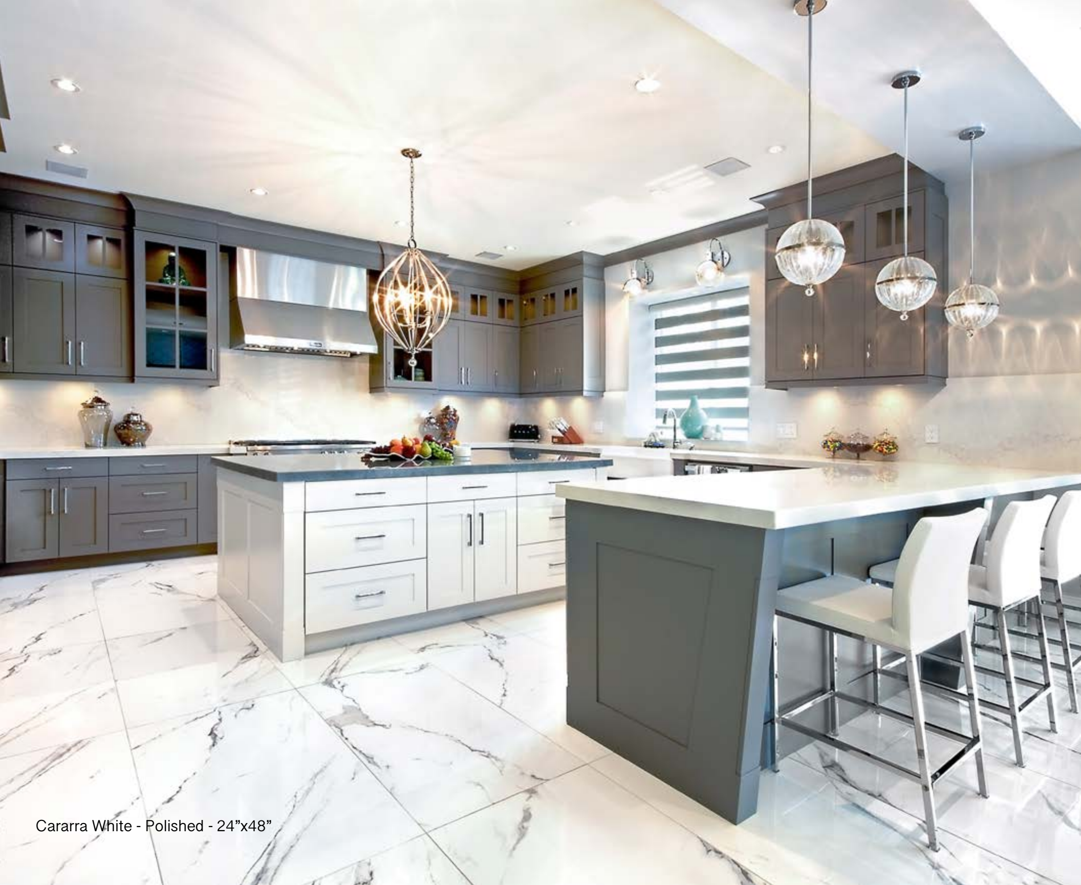
Carrara White - Polished - 24"x48"